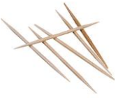
Tooth u pick