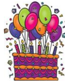
Birth u day