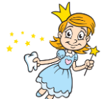
Tooth u fairy