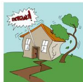
Earth u quake