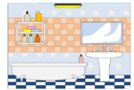
Bath u room