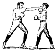
South u paw