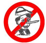
Truth u l