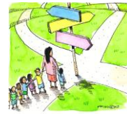
Path u way