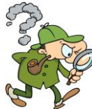
Some u thing