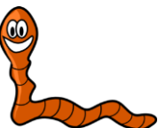
Earth u worm