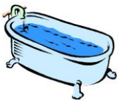
Bath u b