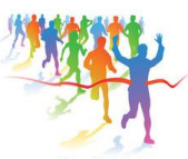
Marath u n